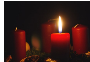
First Sunday of Advent