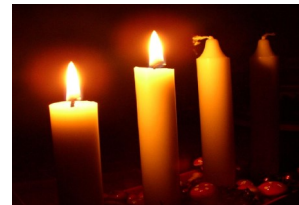
Second Sunday of Advent

"Critical Christmas Doctrines" "Part 2: The Greater Son of David"