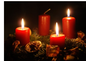
Third Sunday of Advent

"Critical Christmas Doctrines" "Part 3—That Holy One"