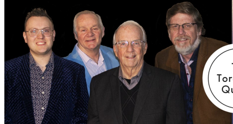
The Torchmen Quartet