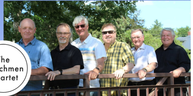
The Watchmen Quartet