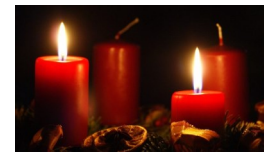
Second Sunday of Advent