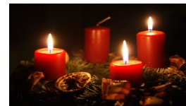
Third Sunday of Advent