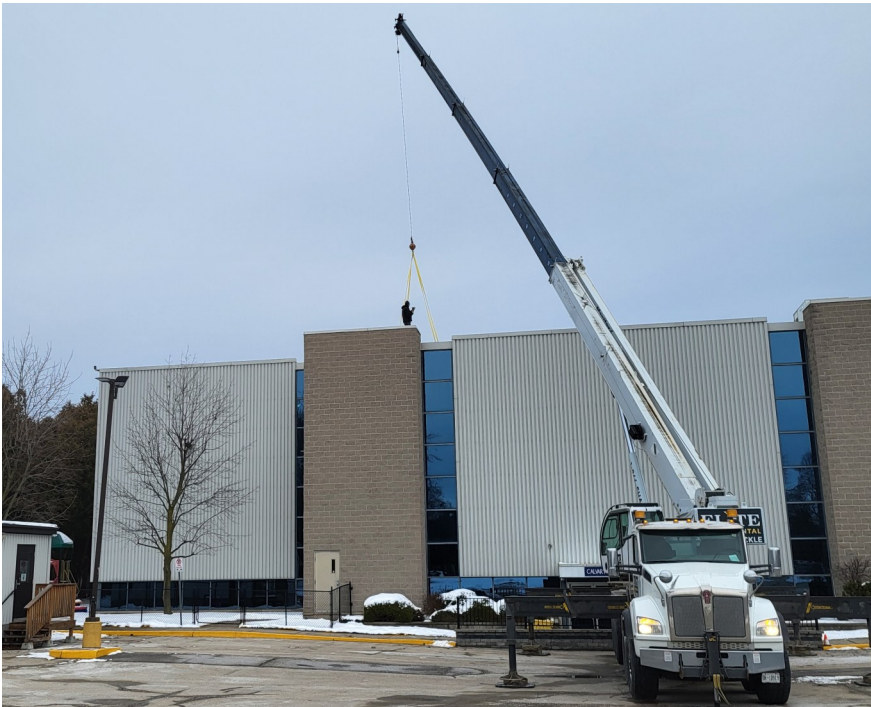
Installer directing crane operator. (Probably rethinking career choice...)