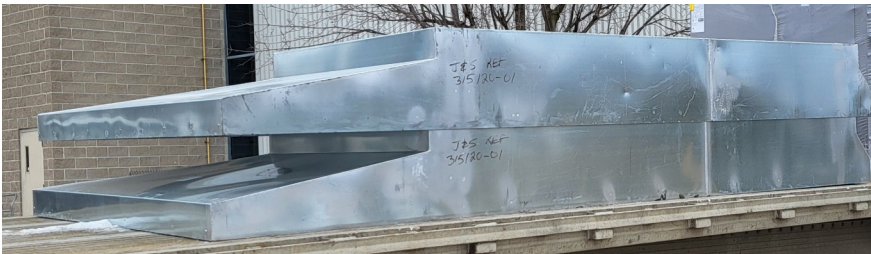
Curbing shows size difference between old and new units.