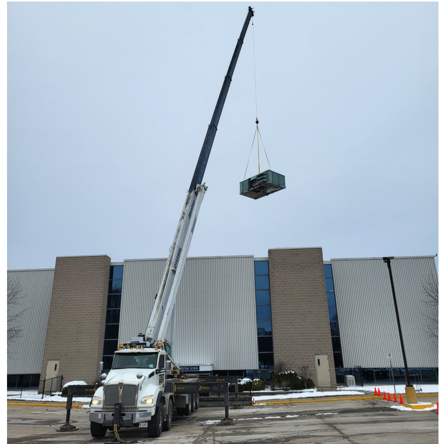
Removal of first old unit. May it rust in peace.