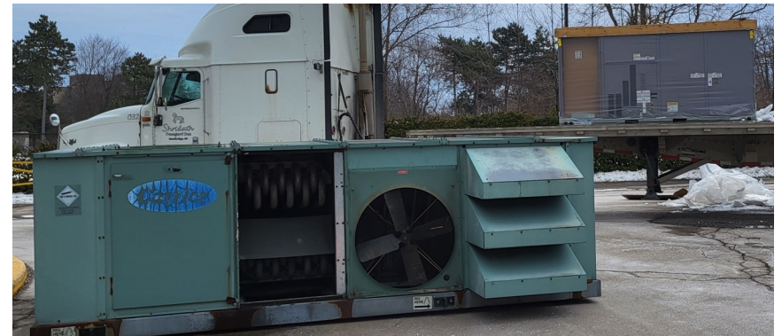
Perspective may be a bit wonky, but gives another idea of size difference.

(Old units: 25 tons — New units: 15 tons)