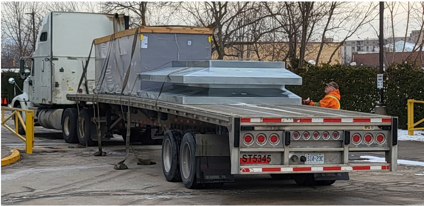
In position to hurry up and wait for the old units to be removed.