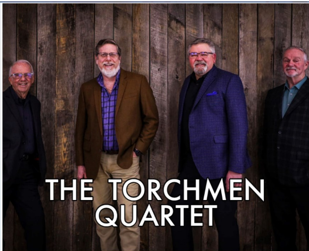
THE TORCHMEN QUARTET

Henley Christian Music Festival The Torchmen Quartet March 31st, 2024 6:30pm